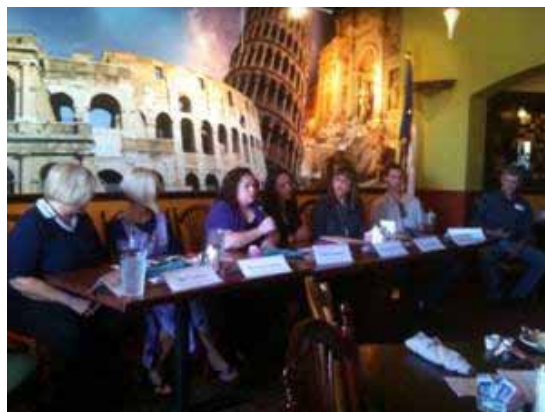
Panel of School Staff Personnel, Parents and Rotarians involved in Early Act FirstKnight @ Oak Hill Rotary meeting on October 7, 2010